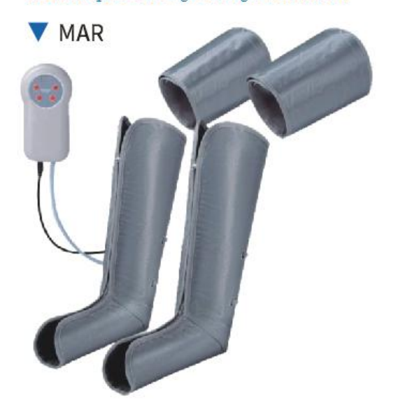
空氣波壓力腿部按摩儀 Air wave pressure leg massage instrument

▲ MAS 空氣波壓力腿部按摩儀 Air wave pressure leg massage instrument