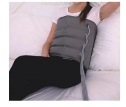
四腔氣動腰部按摩套 Pneumatic waist massage cover - four chambers