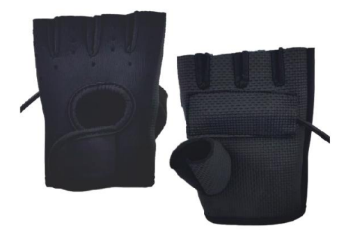
G-05 鏡像手套,控制鏡像訓練 Mirror gloves, for mirror training