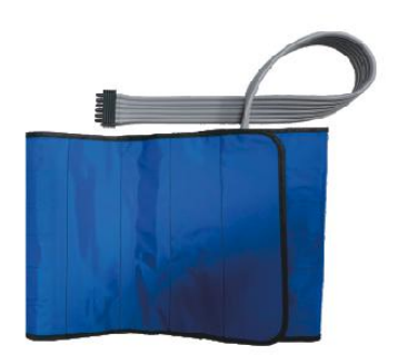
▲ M-65 六腔氣動腰部按摩套 Pneumatic waist massage cover - six chambers

he air wave pressure therapy device is used to repeatedly pressurize the waist and then relieve the pressure to promote blood circulation, lymphatic circulation, and relieve waist fatigue and pain.