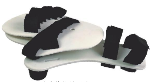
G-04 手腕康復訓練手套 Wrist rehabilitation training gloves

Helping the wrist lift up can help patients with wrist joint obstruction stretch and alleviate the stiffness of wrist fascia.